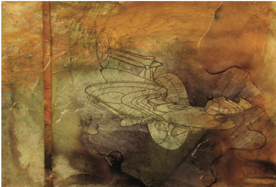
Post-Semiotic Craft (Green) , 2005

The Memorial Gallery is located in Hale Hall, on the campus of Farmingdale State College – State University of New York – 2350 Broadhollow Road (Route. 110). Gallery hours: Monday through Friday from 9 AM–4 PM. Admission is free and the gallery is accessible to persons with mobility impairments. Please call in advance of your trip. For additional information, please call 631-420-2181.